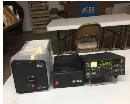
TEN-TEC Argonaut V Model 334A HF Transceiver Sells for $599 Yours for $275.00