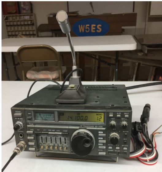
ICOM IC-735 Power cord & Microphone Sells for $498 Yours for $250