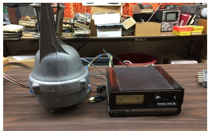
Ham 4 Rotor with a Hy Gain Control box Sells for $350 Yours for $150