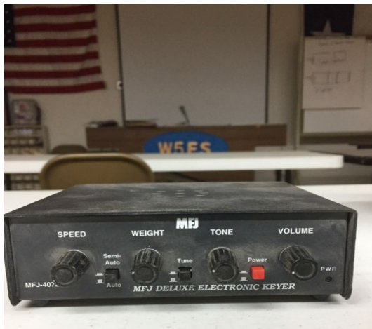
MFJ-4070 Electronic Keyer MAKE OFFER