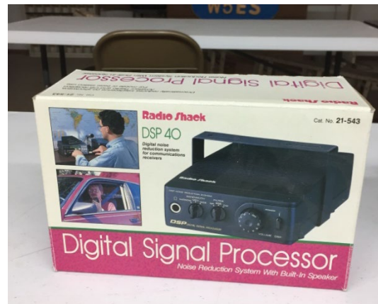
Radio Shack DSP 40 Digital Signal Processor MAKE OFFER