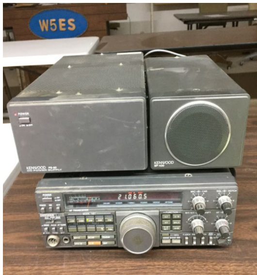
Kenwood TS-440S PS-50 Power Supply & SP-430 Speaker Sells for $300 Yours for $150