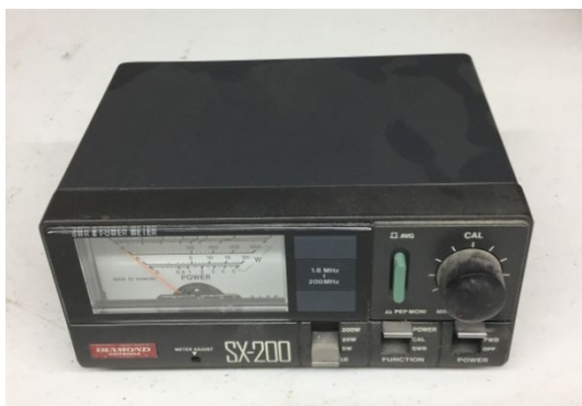
Diamond SX-200 SWR Power Meter 1.8 - 200 MHz 200 Watt Sells for $104 - Yours for $40