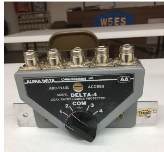
ALPHA DELTA DELTA 4 Antenna Switch with Surge Protection Sells for $109 Yours $50