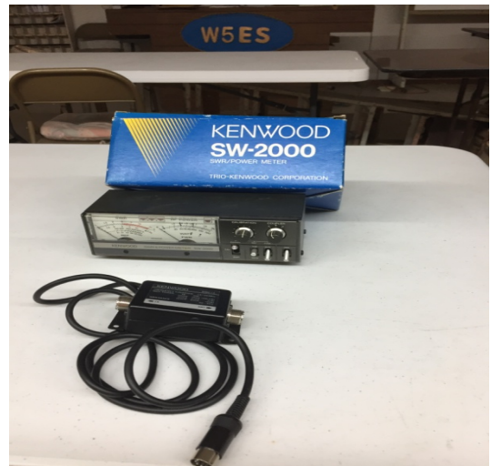
Kenwood SW-2000 SWR/Power Meter HF/Power Meter Watt - HF 2000 UHF 600 Watt Sells for $145 Yours for $75