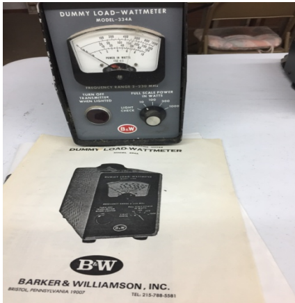
B & W Dummy load / Watt Meter Needs new power cord Sells for 199.95 Yours for $50.00

Please include your Name, Call Sign, your Offer, and the Date. Payment can be made upon delivery by check or cash. Arrangements can be made to pay in advance through PayPal by credit or debit card.